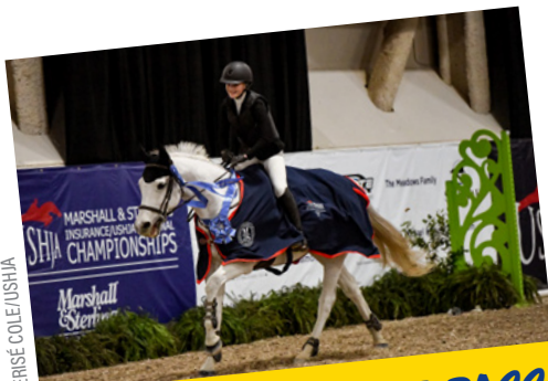
GOLDEN BACKSTAGE PASS